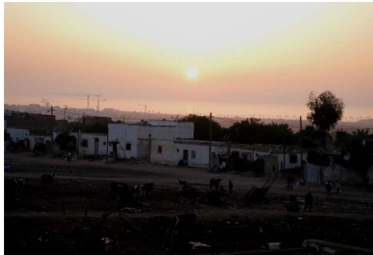
Morocco, Casablanca Slum village

life was to take a simple glass wine bottle and recycle them by creating artistic creations from them. These wine bottles would be supplied by the wealthier neighbors of the slums that live in the city since there is no formal way for recycling bottles other than reusing them. These bottles can easily be turned into cups or glasses for drinking and chandeliers which